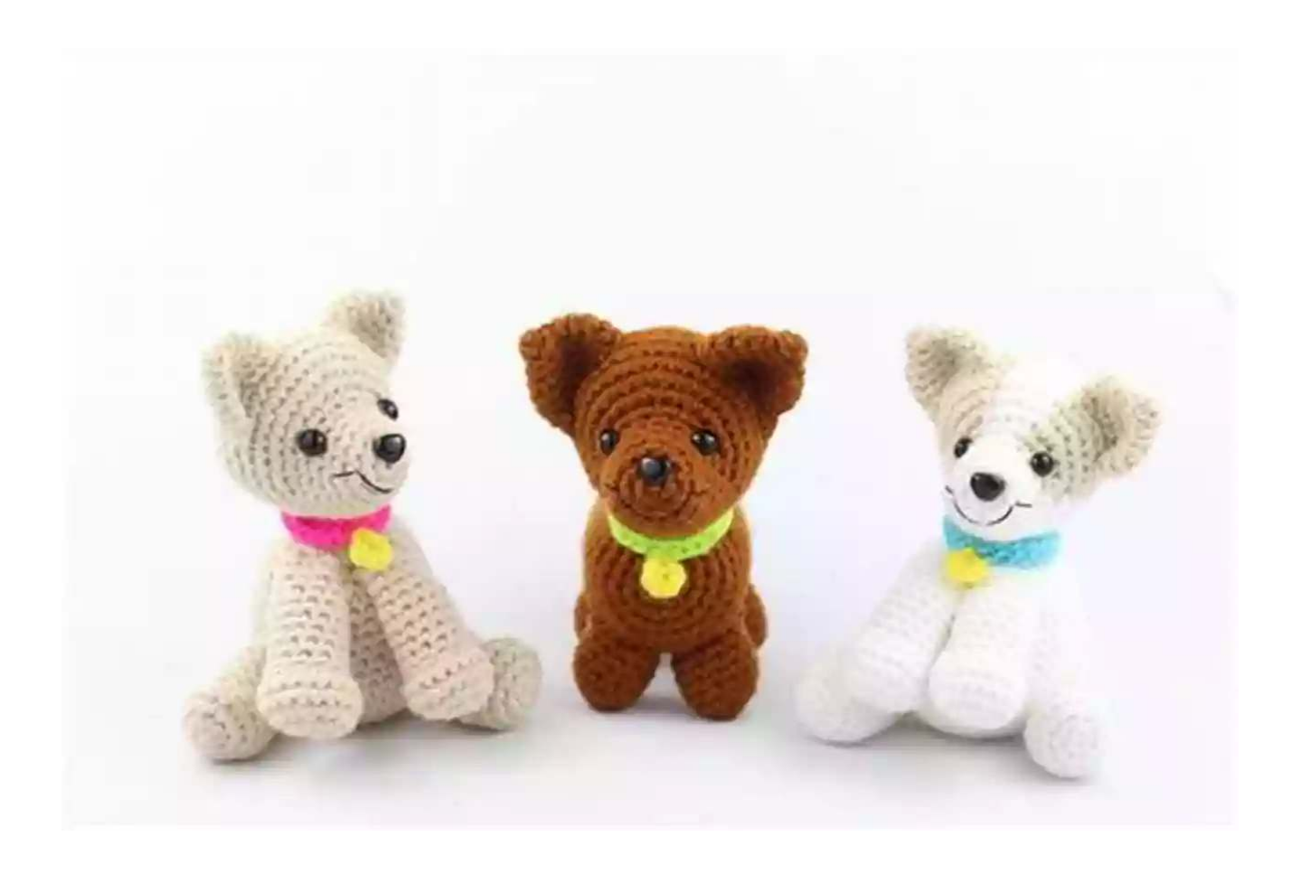
Why Choose the Baby Chihuahua Amigurumi Pattern?

Looking for a fun and adorable crochet project to dive into? Look no further than the Baby Chihuahua Amigurumi pattern! This delightful pattern allows you to create your very own soft, cuddly, and cute chihuahua plushie. Whether you are a beginner or an experienced crocheter, you can easily master this pattern with the help of beginner-friendly crochet pattern books. Get ready to embark on a crochet adventure and create a lovable chihuahua friend!